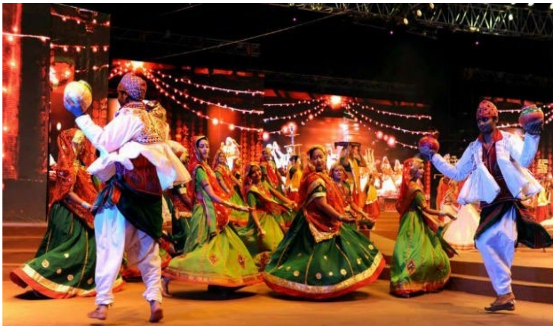
PHOTO 3: NAVRATRI/GUJARATUPDATES.COM Source: http://www.gujaratupdates.com/navratri/