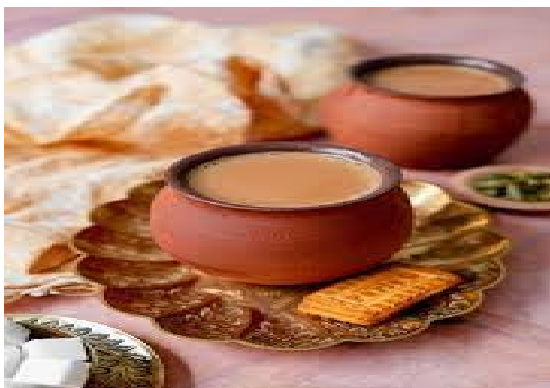
PHOTO 5: AUTHENTIC INDIAN MASALA CHAI (SPICED MILK TEA)