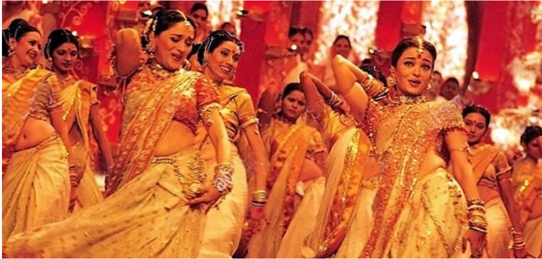
Photo 2: DANCING QUEENS OF BOLLYWOOD BY SASHA Source: www.desiblitiz.com/content/dancing-queens-of-Bollywood