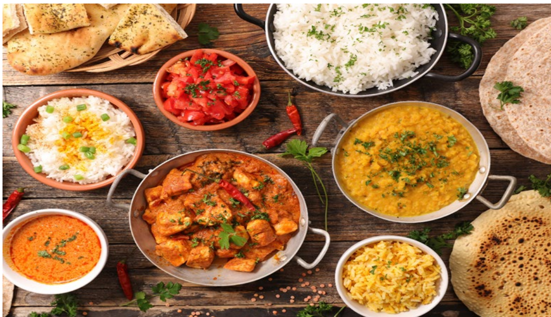
PHOTO 4: TOP 10 INDIAN DISHES AND RECIPES || THE MOST POPULAR INDIAN FOOD