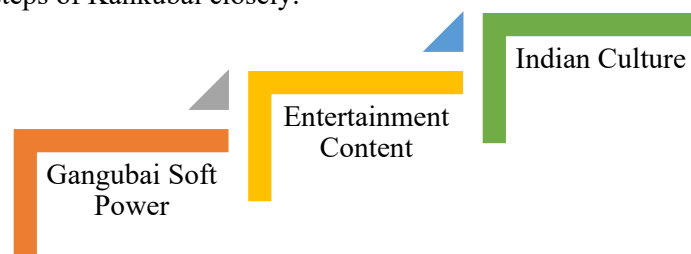
Figure 2: Model Perception of Indian culture towards contents

India is one of the countries known for its tea. The tea culture in India dates back to the British colonial rule of India. Teas in India include black tea, ginger tea, milk tea, or spiced tea known as "Jai". In this movie, tea drinking has a point and is interesting in that Kangkubai drinks tea from a coaster. Instead of drinking tea from the usual cup. The movie implied the matter of class division Because Kangkubai was a prostitute, he was racist by society. And she expressed herself through tea drinking as a person of an inferior class. Drinking tea from this saucer is still part of the Indian tradition of drinking it today. But for reasons that have changed This makes hot tea cool down faster. to make it easier to drink here are the 5 unique cultural traditions of India featured in the movie "Gangubai Kathiawadi, The Strong Woman of Mumbai" that many have probably heard of. or some people may have had the opportunity to experience it deeply Including some people, after watching this movie, who have plans to follow in the footsteps of Kankubai closely.