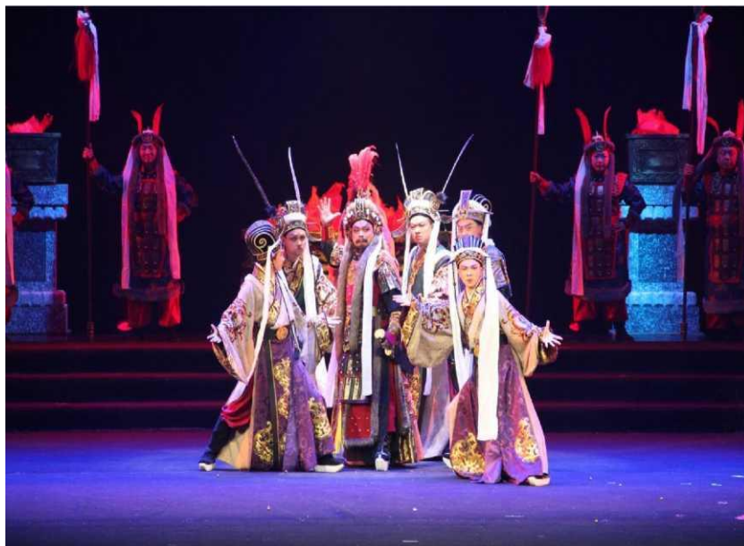
Figure 3 Empress Dowager of the Xingguo