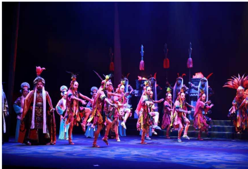
Figure 2 Empress Dowager of the Xingguo