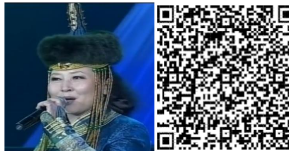
Figure 2 Prairie Love: An In-Depth Analysis