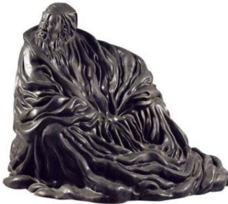
Figure 2 Chen Yungang, The river flows eastward, 1999.

Note: https://www.namoc.org/xwzx/zt/xj/syzt/zp/201403/t20140306_274354.html