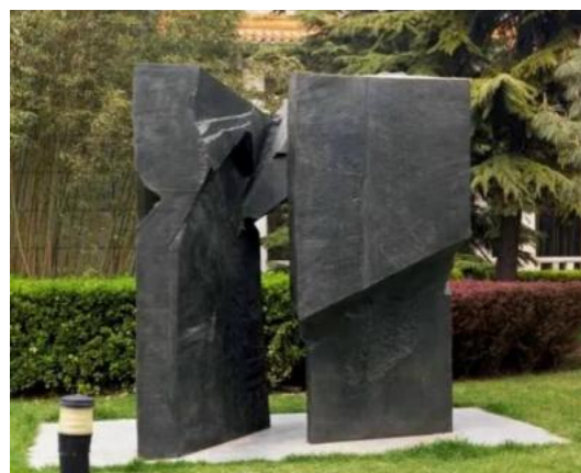
Figure 4 Zhu Ming Tai Chi-Arch, 2000.

Note: https://www.namoc.org/zgmsg/xw2023/202312/4896b11b49484aa5a1621f47a4ac656f.shtml