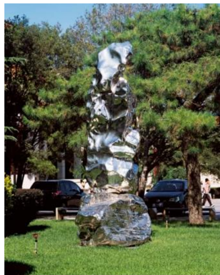
Figure 5 Zhan Wang Rockery Series, 1995.

Note: https://www.namoc.org/zgmsg/xw2023/202312/768b85c0600a46b3806c7a44689ce633.shtml