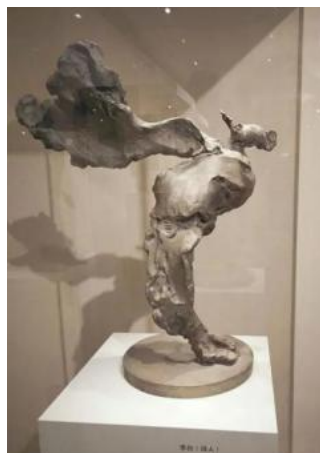
Figure 3 Wu Weishan, Poet Li Bai, 2012.

Note: https://www.duitang.com/blog/?id=707715958