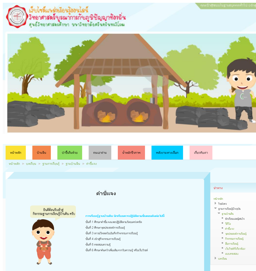
Figure2: Online science learning resource integrated with the local wisdom

Science learning stations are composed of 1) adobe clay house, 2) charcoal, 3) bio-extraction, 4) alternative energy and 5) community forest. In order to develop the website, we have integrated this project with the subject related to innovative science learning course for first year doctoral students of Science Education Center. The students are involved in designing the website, creating learning activities, worksheets and important information under the suggestions of the course instructors and expert. The website can be seen in Figure 2.