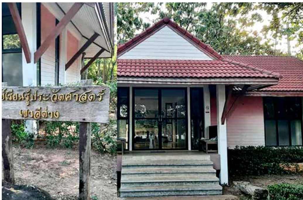
Figure 5 Kao I Dang Learning Centre

Anunchai Puphiloek (Interview, 5 March 2020) stated that the Tubtim Siam 03 Project is a project that can be said to have learned from the past to build immunity for the future. The area of Thap Thai Village was used as a center for receiving refugees from the war in 1979 (SITE 2) but the Oriental Army has now established Thap Thai Village as a self-defense village along the border. The village establishment is designed to be easy to manage, maintain, and protect. One rai of land was allocated to each family as a living space, and another 20 rai of arable land was also allocated. All houses were built by the government based on the same plan. Wanee Puphiluek (Interview, 5 March 2020) stated that Tubtim Siam 03 is a border self-defense village area. The main purpose is for people to stay in villages to protect the area and prohibit Khmer immigrants from entering the area. It is an incentive for people to come and settle on the border. The project gave veterans rights to local people who do not have a place to live and volunteers who want to settle in the border area.