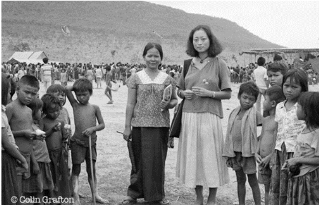
Figure 2 Refugees and volunteers at Kao I Dang Holding Centre.

problem abated when Vietnamese forces withdrew from Cambodia in early 1989, and several Cambodian political parties signed the Paris Peace Agreements in October 1991. A Cambodian national election was also held in 1993 under UNTAC supervision and all refugee camps in Thai-Cambodian border areas were closed in March 1993 (UNHCR, 2000, p. 96-7).