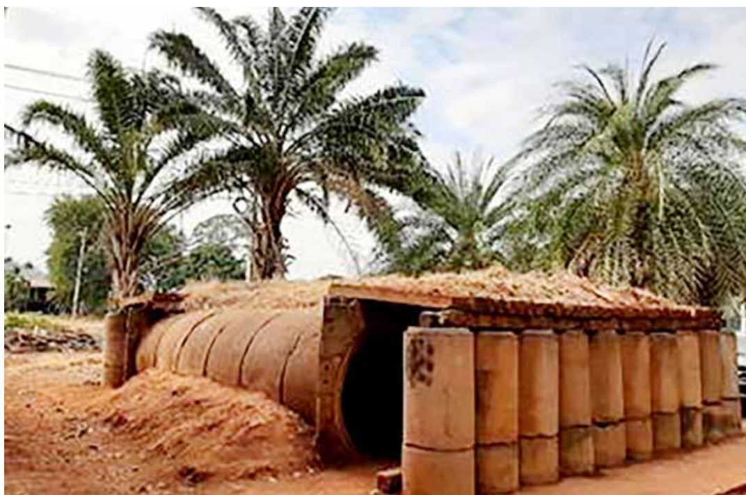
Figure 4 Ban Klong Yai's bunker, Chanthaburi

Development will be stabilized and sustained by adding value. Therefore, refugee camp projects have emerged. In the past, SITE 2 was a place that held valuable memories for those who had lived there before. When local people understand it, it can create value for the local area in terms of tourism and the economy. Jan Bunphul (Interview, 8 December 2019)—the sub-district headman stated that the project must be completed with the cooperation of the villagers since the projects should benefit the villagers in return thus making the project more sustainable. Many villagers have come up with suggestions on repairing and restoring memorials, such as restoring a bunker since it will serve as evidence of the situation actually happening in the area. This is beneficial for the locals in terms of tourist and local development.