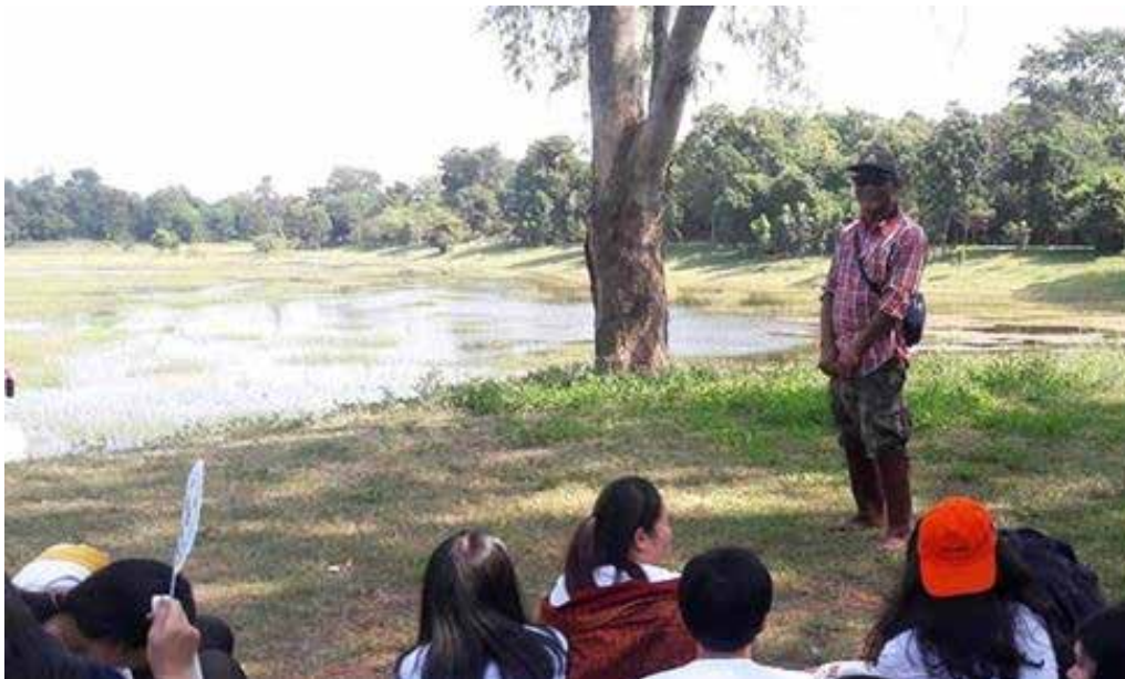
Figure 1 The Baray of Sdok Kok Thom (It was a field of chili and basil trees).

Therefore, this research aims to interview people who can share their experiences during the time when the refugee camps were in place, with great assistance from the Subdistrict Administrative Organization in selecting and contacting people with experience and giving consent to convey information to the research project. This research is interested in the villagers' spatial perspectives regarding the current conditional problems of the area, where the area conditions presented by authorities are different from those described by the villagers. People who have lived in the area for a long time know the background of the area. For example, the area of Prasat Sdok Kok Thom is presented as a national museum or a historical park, according to official information. The site is a Hindu religious place based on the beliefs of the ancient Khmers. However, the local version explains that Prasat Sdok Kok Thom was once a place of refugees from the civil war in Cambodia and used to be a community of Khmer immigrants. It was a meeting area for Thai border people and Khmer immigrants in the form of a bustling border trade market.