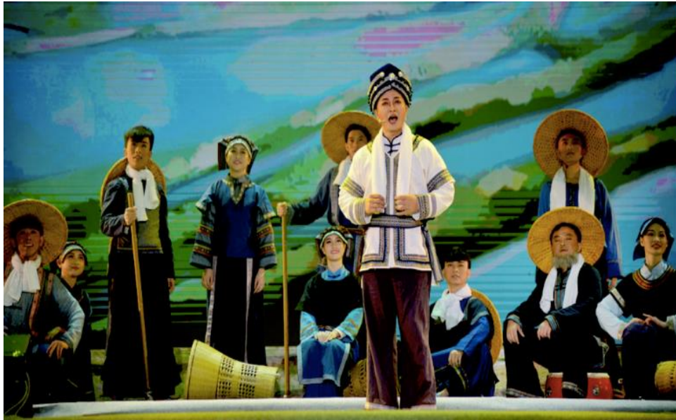
Figure 4: Scenes from the play