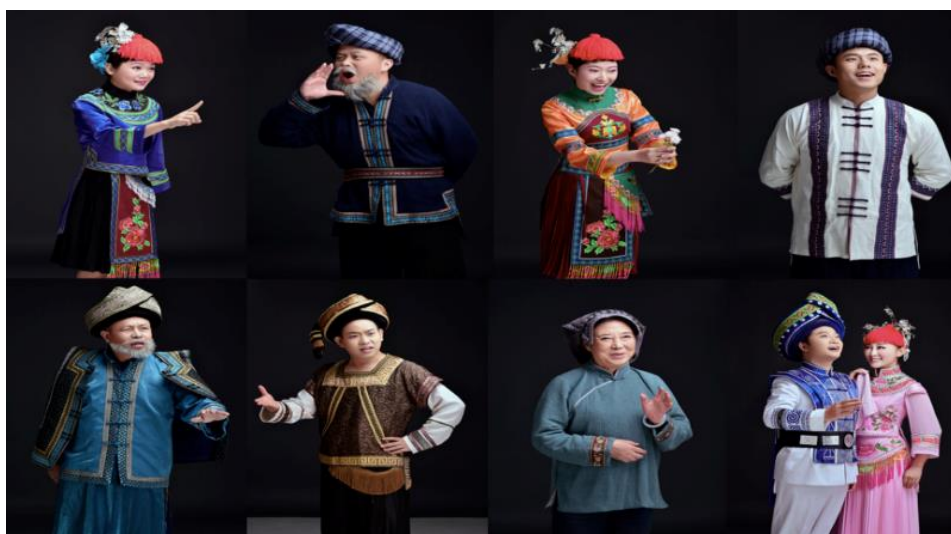
Figure 3: Characters and costumes in the musical