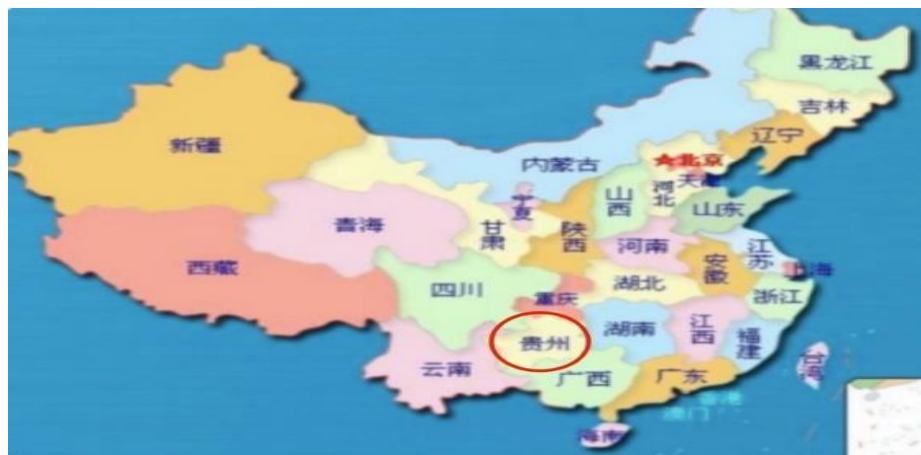
Figure 2: Map of China - Location of Guizhou