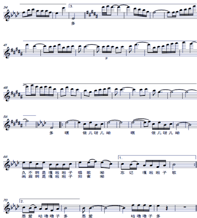
Figure 10: composed song sheet music NO. 1

In dramatic performance, stage lighting design is an important content of dramatic performance, which helps to improve the emotional expression and visual impact of stage performance. In stage lighting design, the characters' emotions are expressed through light and color, the scene atmosphere is exaggerated, the plot conflicts are strengthened, the ideological theme is highlighted, and the aesthetic conception is created, which brings the audience a strong visual impact and artistic appeal. With color as the medium, it provides the audience with a vivid visual image, and creates emotional resonance with the audience through the state, contrast and collocation of colors.