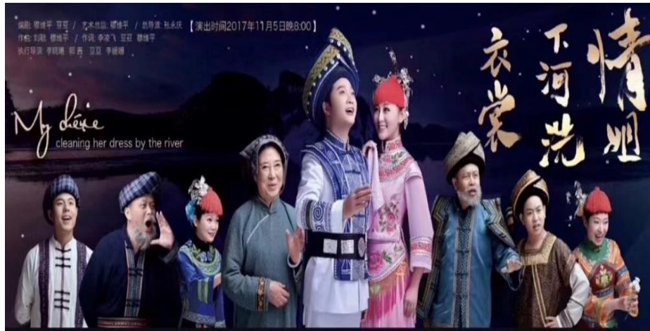
Figure 1: Musical poster