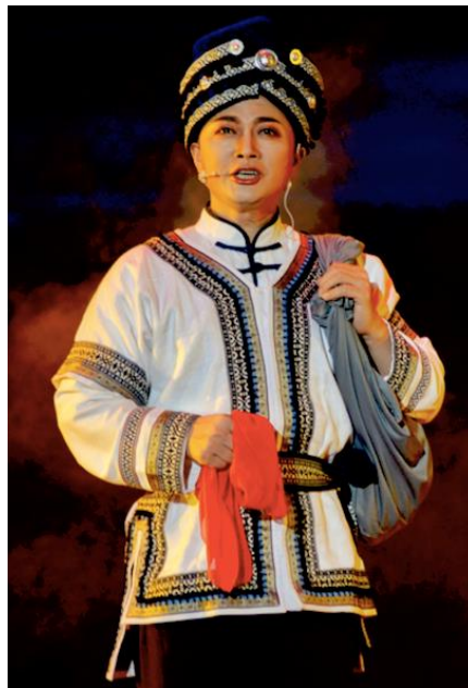
Figure 5: actors in the play