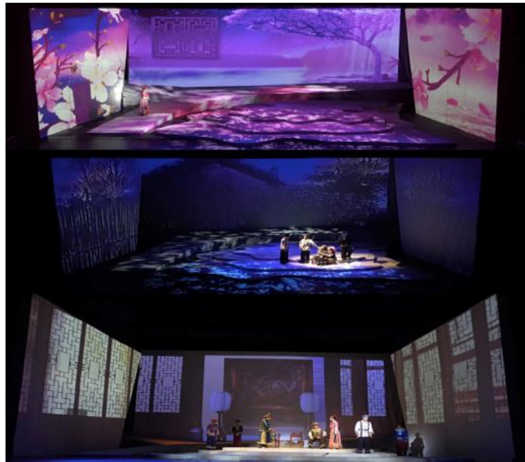
Figure 6: Stage art display in the play